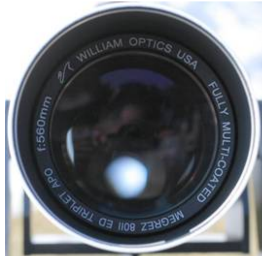
Note the lack of blackening on the dew shield retaining ring

I'd like to have seen some cork on the bottom of the L-bracket. While the bracket allowed me to attach the scope to my Gibraltar, because it was only attached at one point, it was prone to twisting. I've recently been shipped a ZenithStar 80 for review, and although it uses a similar system, they are now putting cork on the bottom of the bracket, and it completely eliminates this issue. It would alternately have been nice to see the L-bracket tapped for two screw holes to help secure the scope on other mounts.