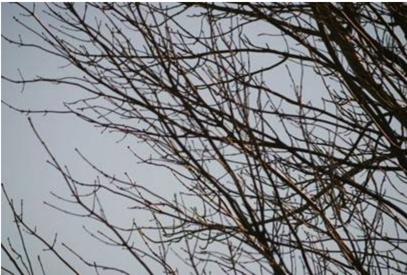
Branches against a bright sky are an excellent test of chromatic aberration

The first ED triplet I was sent for review failed its star test. While it gave acceptable low and moderate power views, higher powers showed it clearly out of optical alignment.