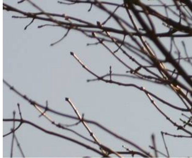
Full zoom of previous shot

Optically, the scope performed well. Views through my 133lpi ronchi eyepiece showed the objective to be fairly well figured and free of any obvious significant defects, a result confirmed by the star test. There was that "snap" to focus you expect out of a good optic, and when the opportunity presented itself, it took magnification quite well. Routinely I was able to use 150x to 160x on Saturn, and over 200x on the moon. One night, graced with excellent seeing, the scope easily took over 300x on Luna. While this didn't reveal any more detail than I could see with lower powers, the views remained sharp and well defined – and more to the point, it was just plain fun!