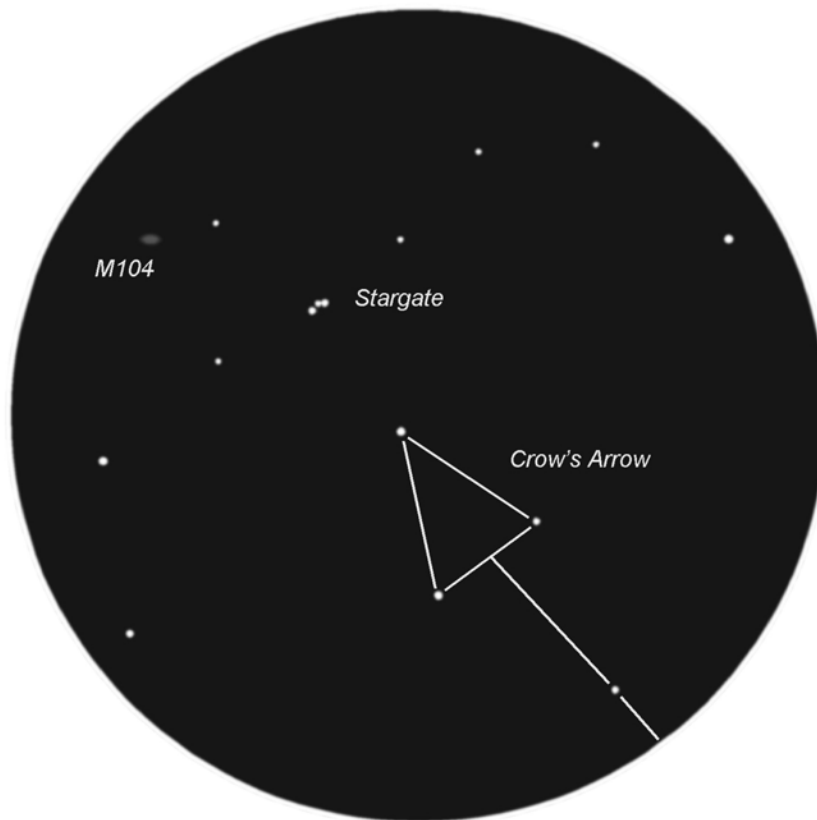
Left: A sketch of M104 and surroundings made by the author through his 10x50 binoculars.