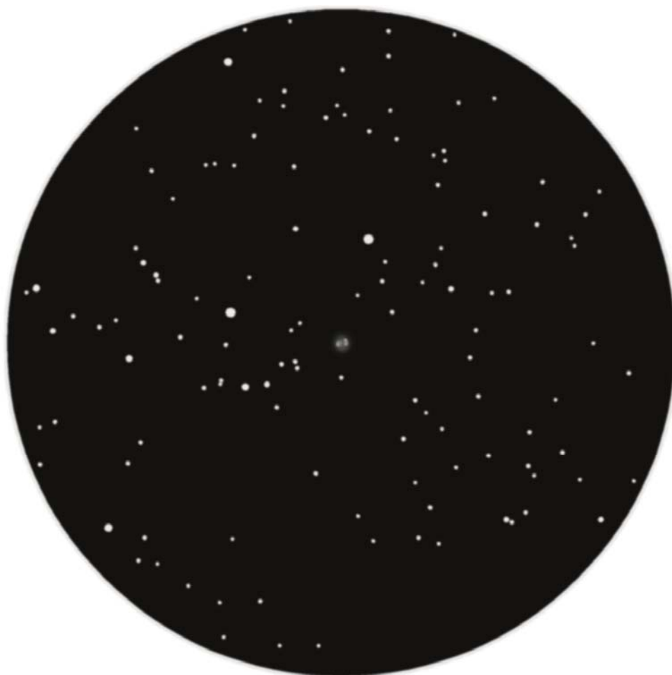
Left: NGC 2169 and surroundings as seen through the author's 10x50 binoculars.